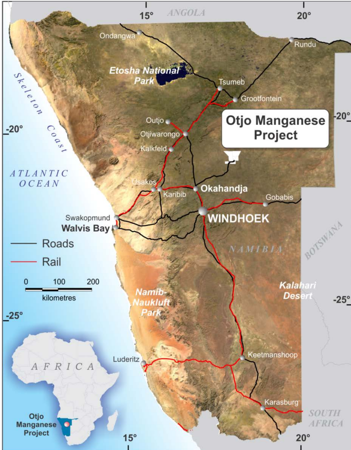
Figure 1 Location Diagram Otjo Project, Namibia