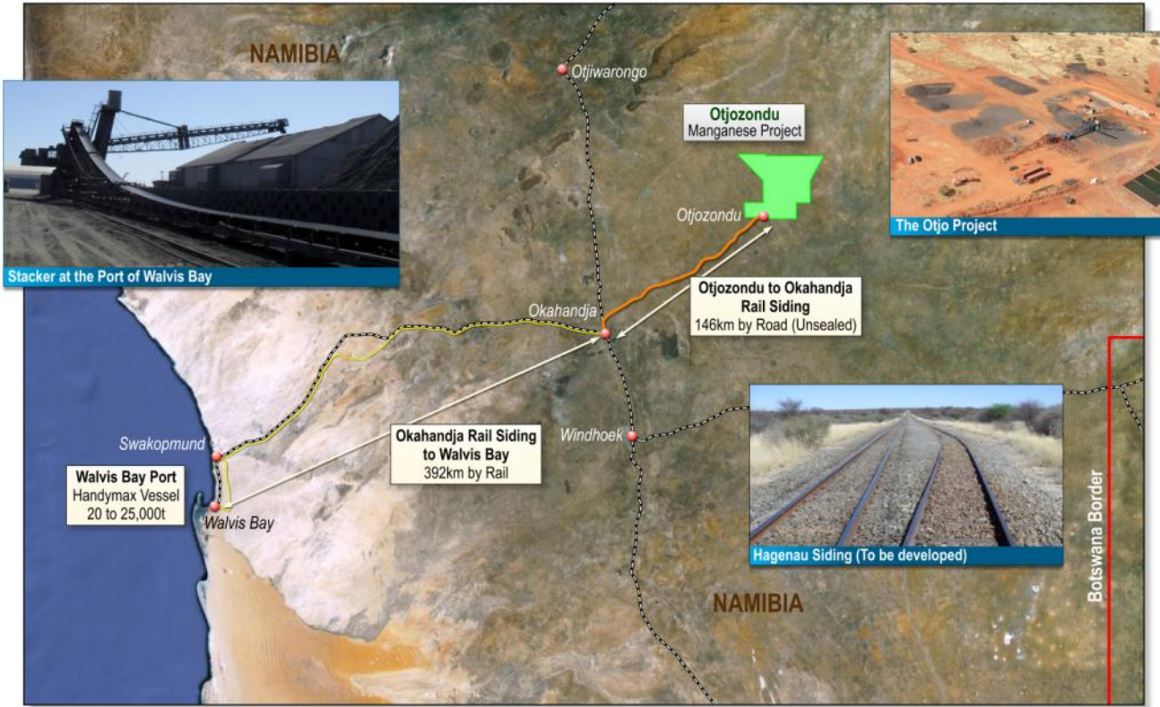
Figure 1 Location Diagram Otjo Manganese Project, Namibia, Walvis Bay Port