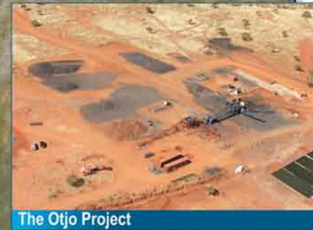
The Otjo Project