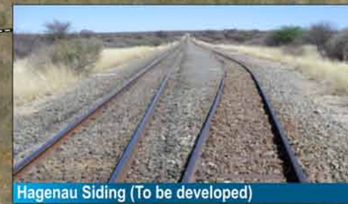
Hagenau Siding (To be developed)